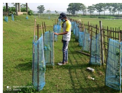
Location: Madhya Mayong School