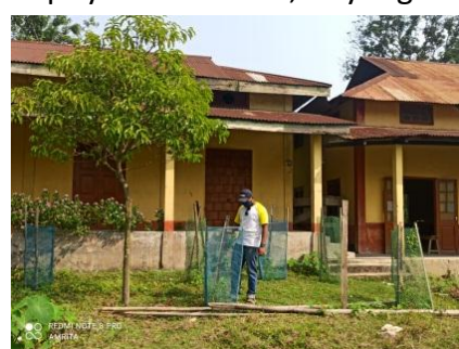
Location: Mayong HS School