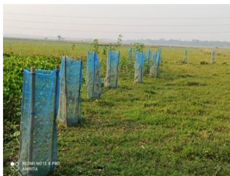
Location: Mayong Museum School