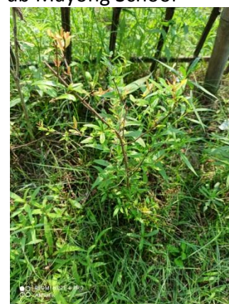
Location: Mayong LP