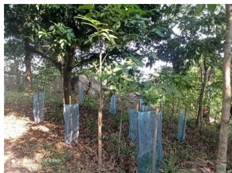
Location: Mayong Shiv Mandir