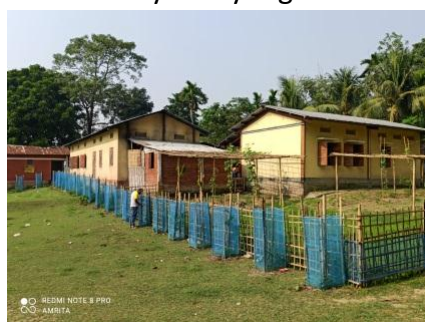
Location: Pub Mayong School