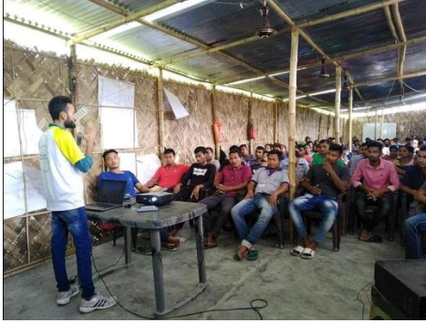
Kharupetia, Darrang District, 20 th August 2019

Training centre of Ajitaaksh Ventures Pvt. Ltd