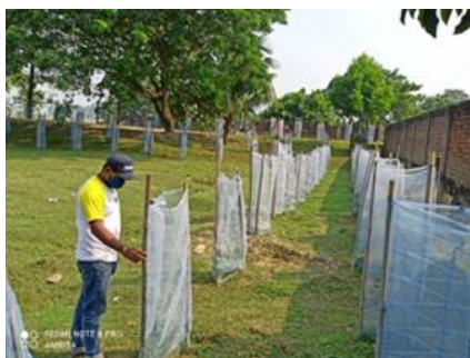
Location: Lokpriya GNB School, Mayong