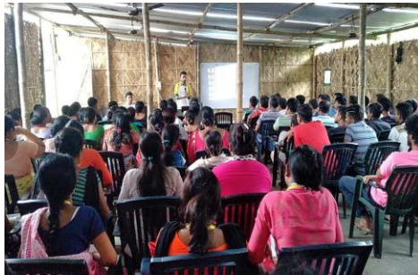
Mangaldoi, Darrang District, 28 th August 2019

Training centre of Ajitaaksh Ventures Pvt. Ltd