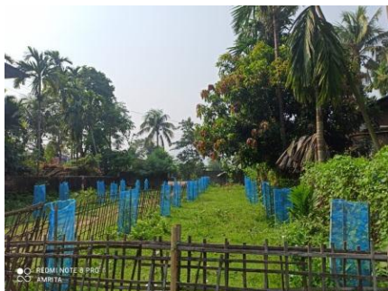
Location: Mayong Girls School